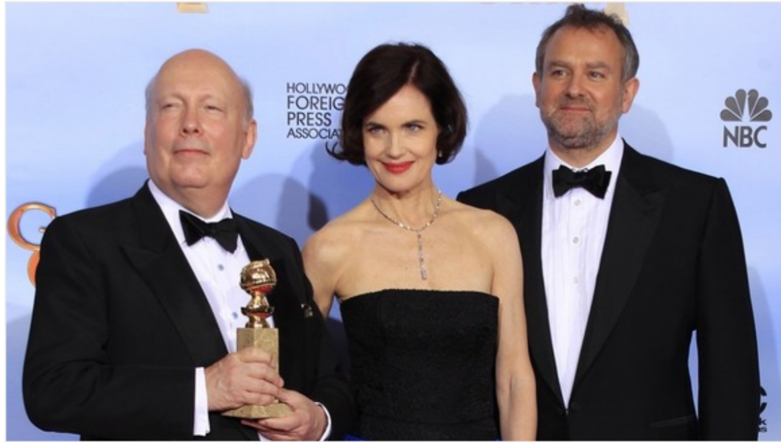
Julian Fellowes (left) with actors Elizabeth McGovern and Hugh Bonneville.

Oscar-winning writer Julian Fellowes has criticised James Cameron's hit Titanic movie for vilifying the ship's first officer by portraying him as a coward.