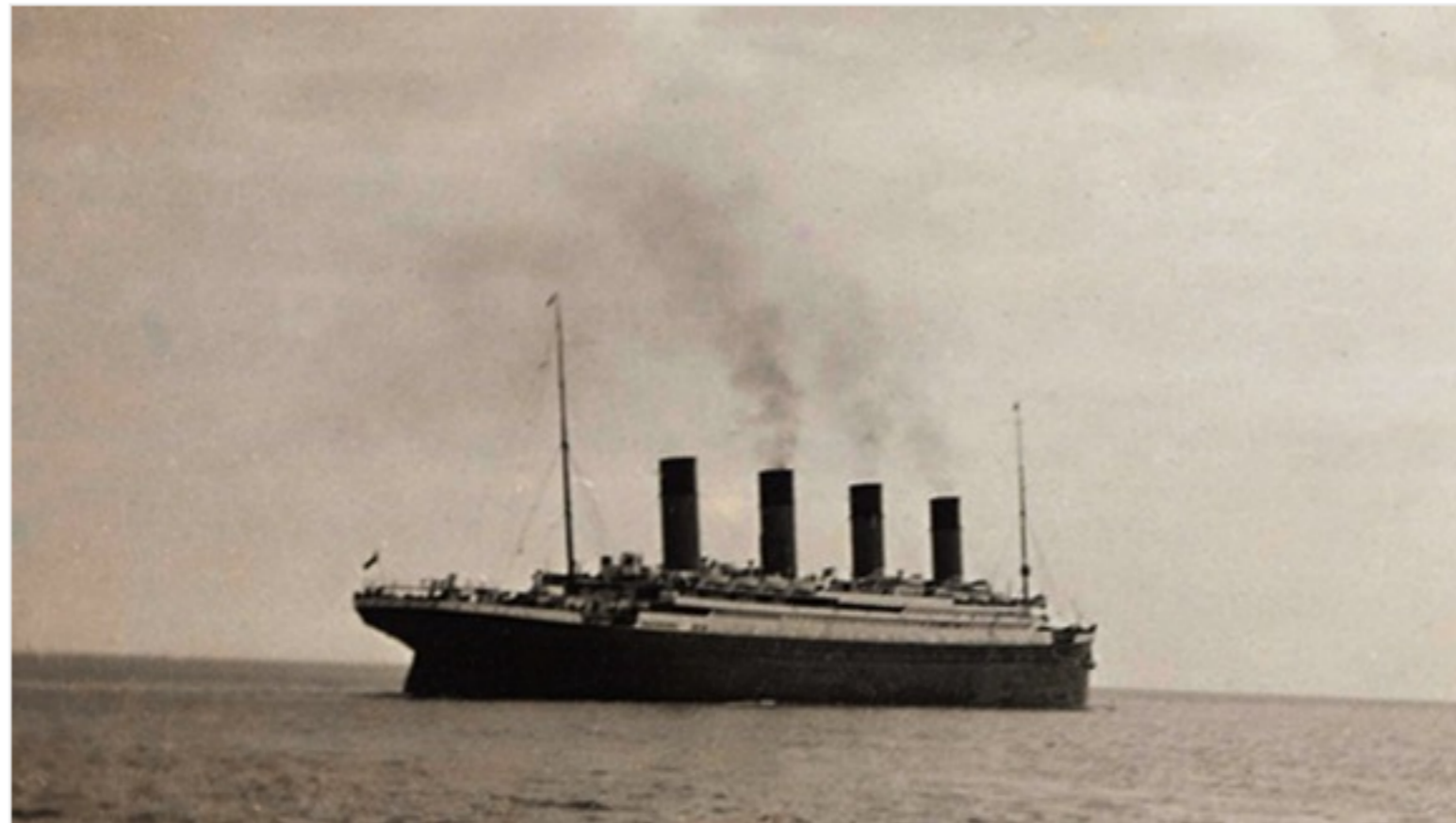
A photograph of the Titanic, believed to be the last known image of the ship.

But Fellowes told the Radio Times that the 1997 film, starring Kate Winslet and Leonardo DiCaprio, had unfairly portrayed William Murdoch, who was first officer on RMS Titanic.